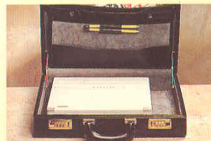
Specially designed to occupy less space in your briefcase.