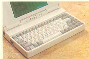
Reduced wrist strain with a low profile 84-key AT keyboard.