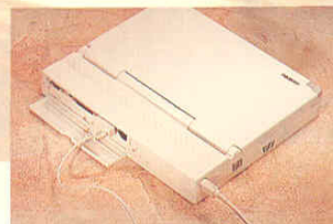
Modem port turns unit into two way fax. Unit also connects external video screen, printer, mouse and keyboard.

as intelligently as the NoteBook is designed to. Knowledge is power, and knowing how to use these features will stretch your useful power.