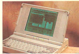
High resolution LCD screen for sharp, clear text and graphics.