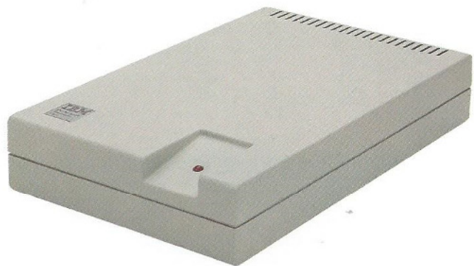
IBM 5178 PC Network Translator Unit