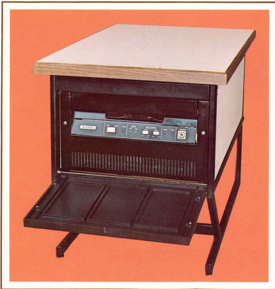
Model 16 Hard Disk Subsystem • Cover Open

MICROCOBOL is a language and operating system for the development and running of COBOL programs. It includes the MICROCOBOL compiler, interactive text editor, and linker and subroutine library. Also available is a powerful file management and report generation program called Autoclerk